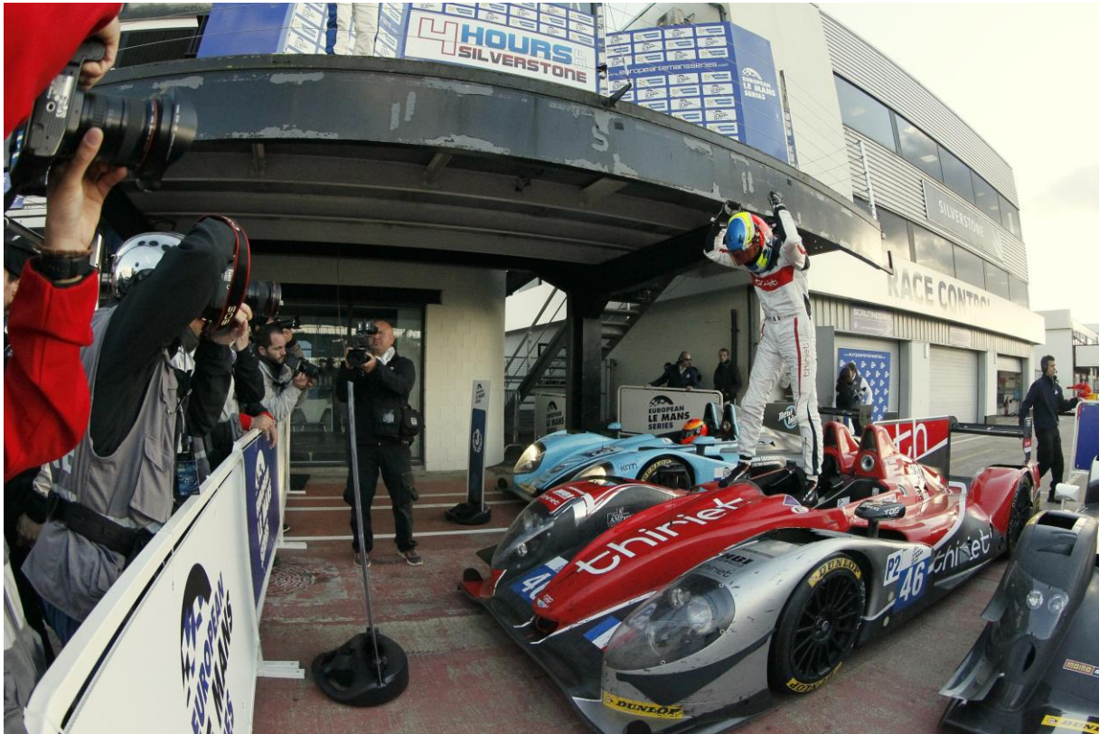
ELMS victory at Silverstone (2014)