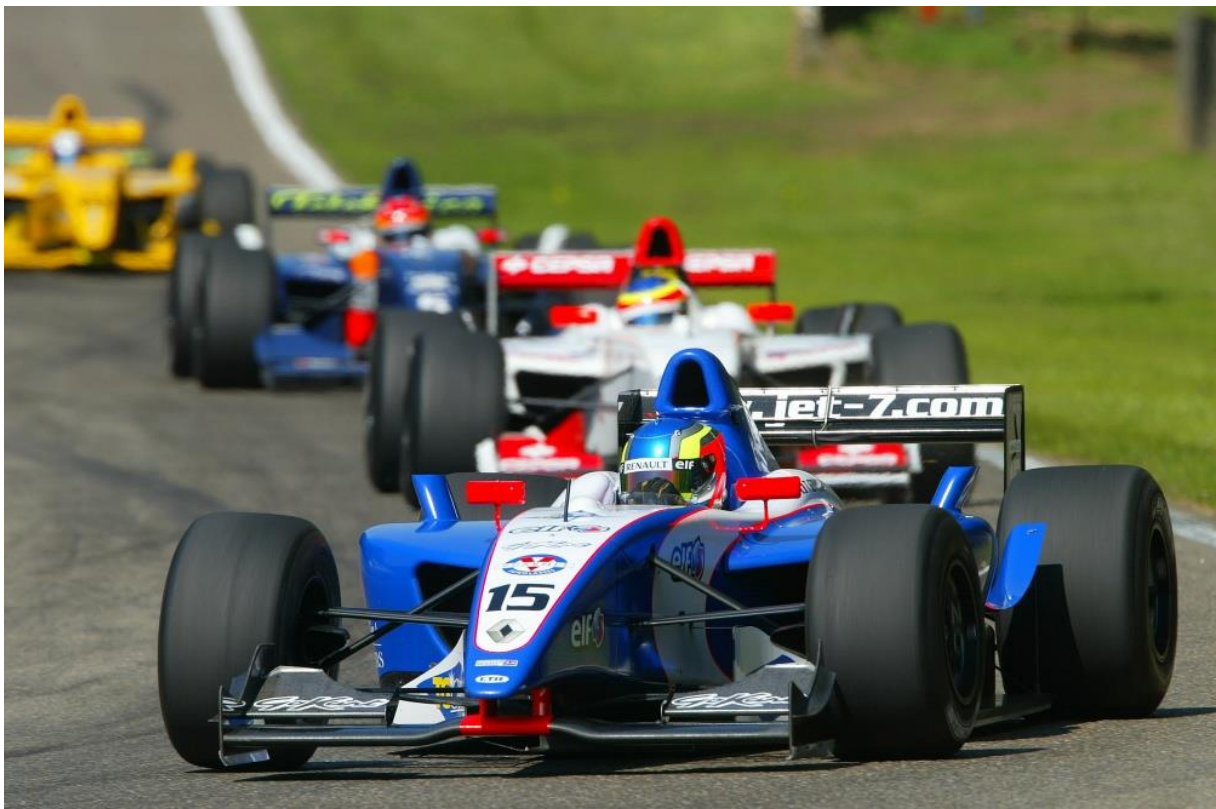
World Series by Renault 3.5 Valencia Winner