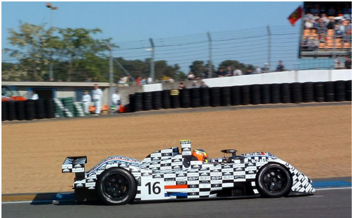
LMP1 Dôme Official driver