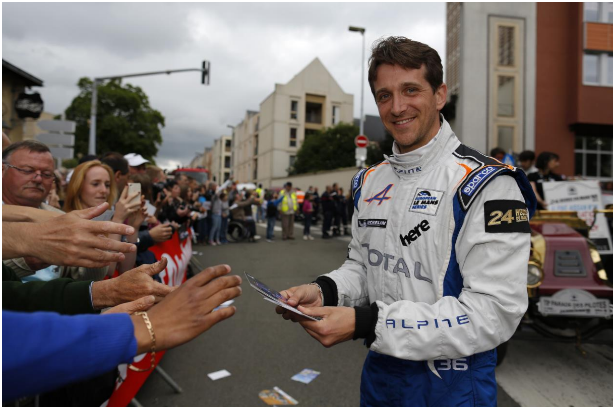
LMP2 Alpine official driver (2013)