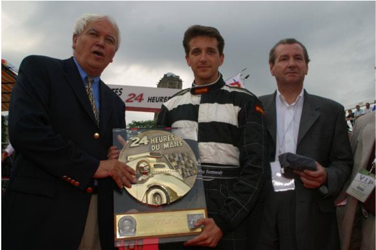
“Rookie of the year” award Le Mans 24 Hours