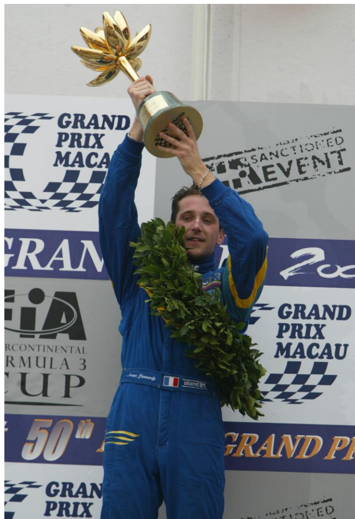
Macau F3 victory