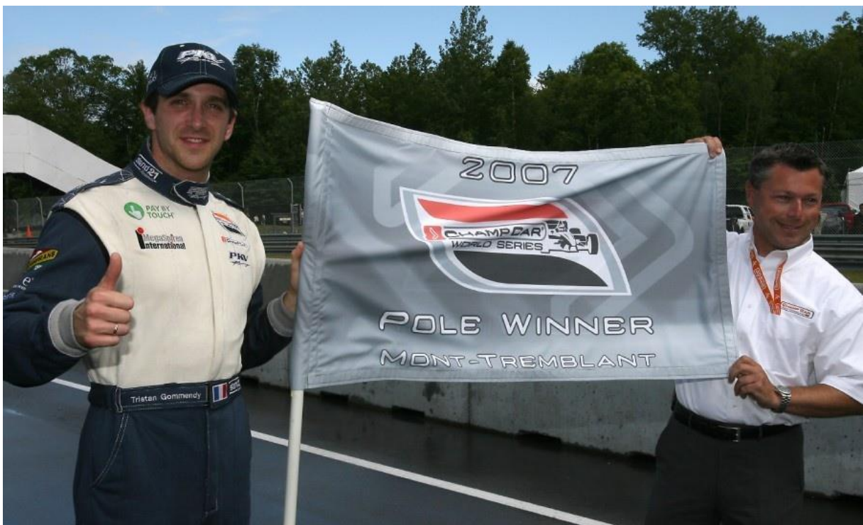
ChampCar Pole Position