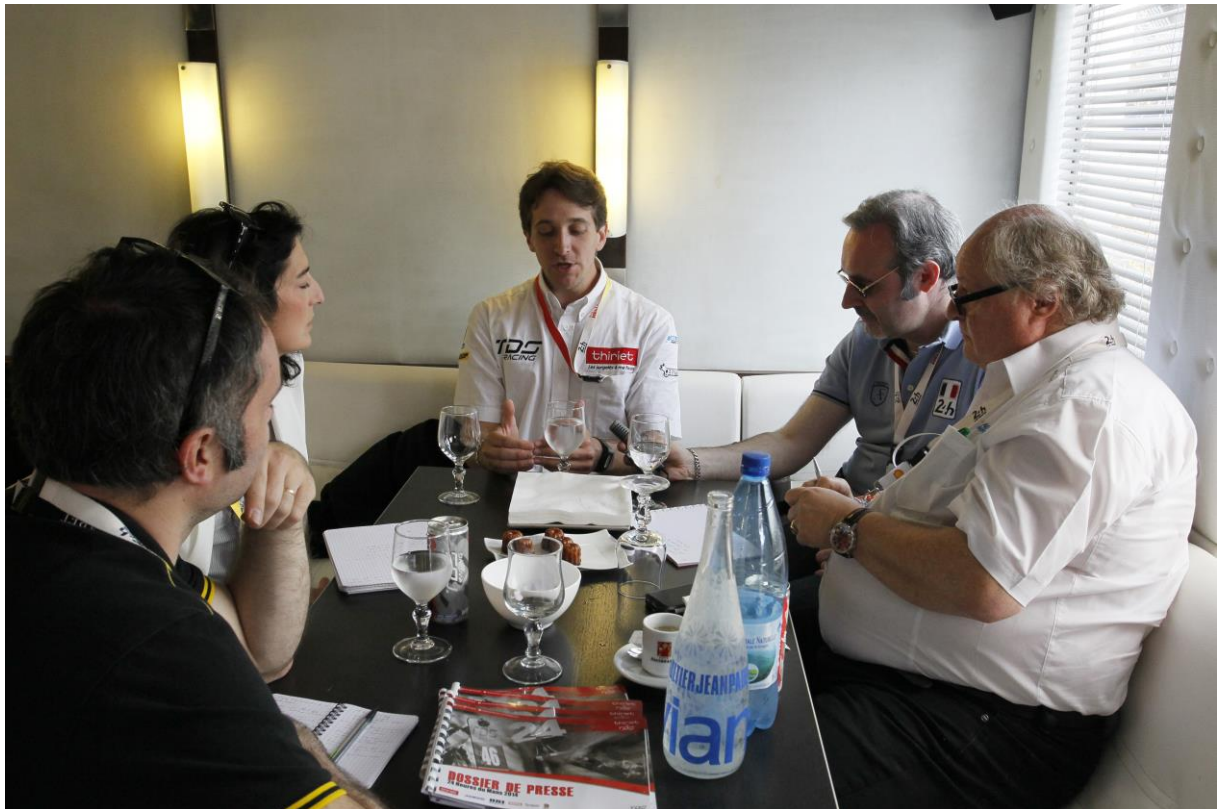
Le Mans 24 Hours: press conference (2014)