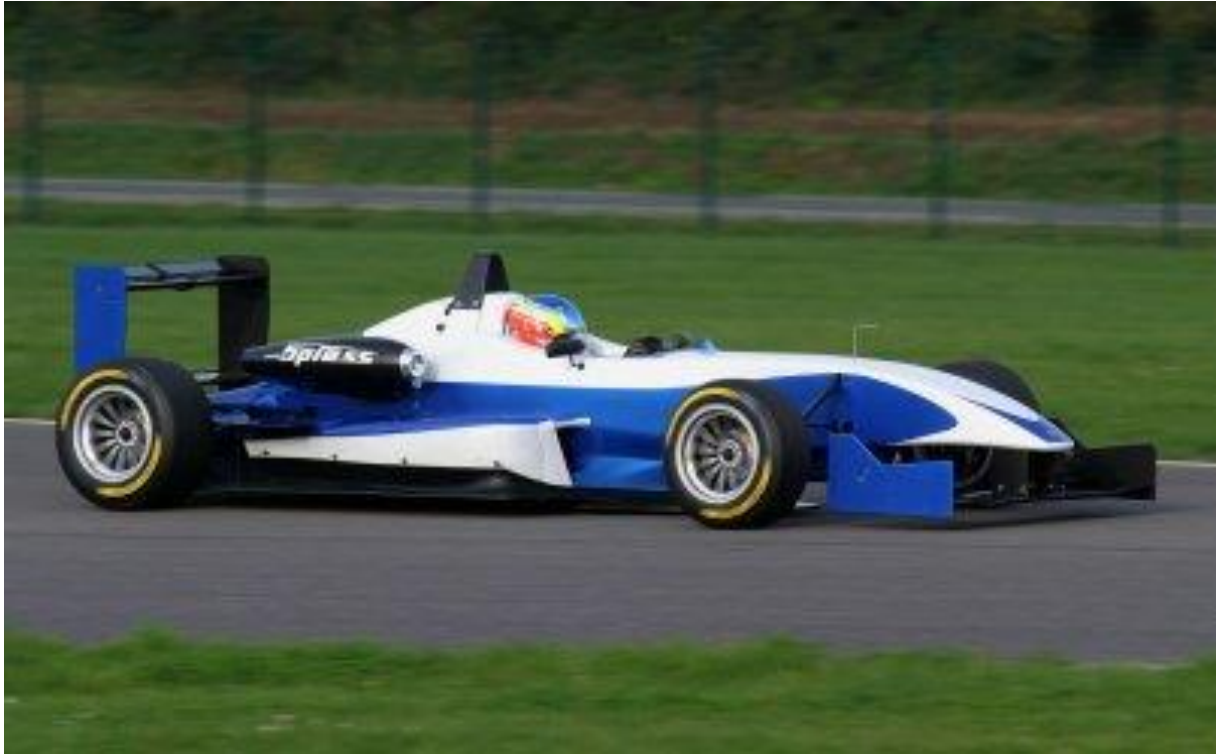
Ligier F3 Official test Driver