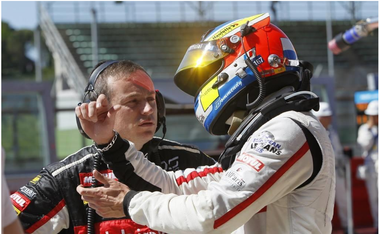
Thiriet by TDS Racing: leading the ELMS championship (2014)