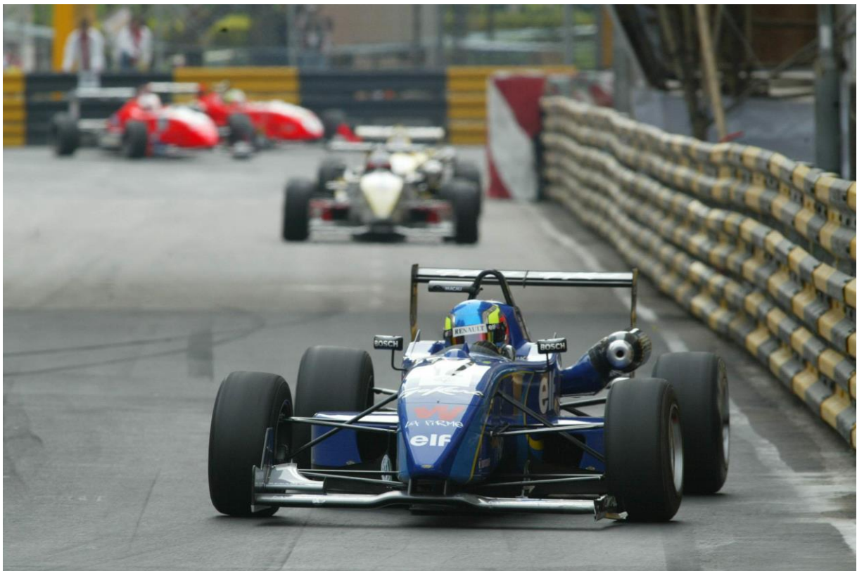
F3 French champion & Macau winner