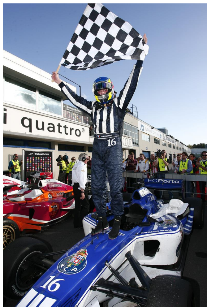
Victory in Superleague Formula championship